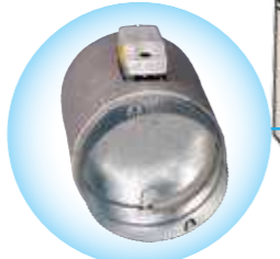
Siemens Motorised Damper