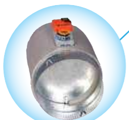
Belimo Motorised Damper