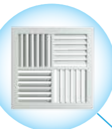
Supply Air Outlet