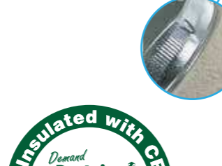
Superior Flow Patented Insulated Collar "Y" with "V" - Clamping System